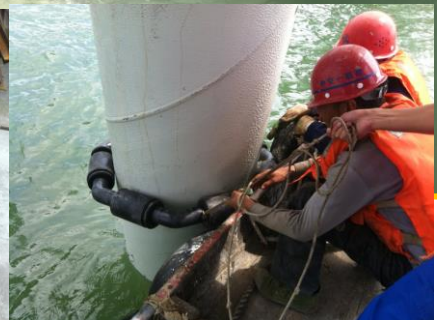
MGP installed around jetty piles at site