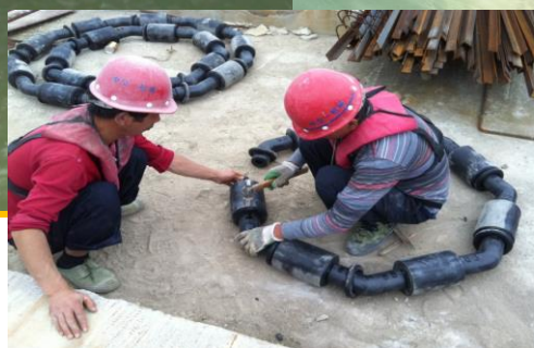
Assembly of MGP at site