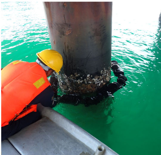
Figure 1 : Single-ring MGP installation onto a Jetty pile

Its installation can be summarized into assembly and installation onto the jetty piles; in a single deployment, without the need of divers, interruption to operation or special equipment (Figure 1). Once installed the MGP harnesses the power from the waves to achieve a zero-growth profile on the jetty structures without the need of any further intervention.