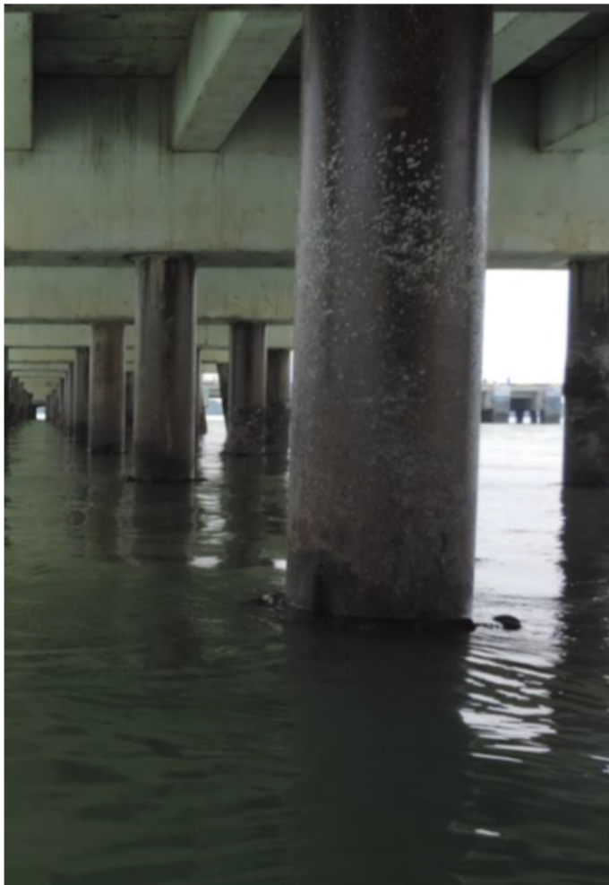
Figure 3 Single-ring MGP 20 years after installation